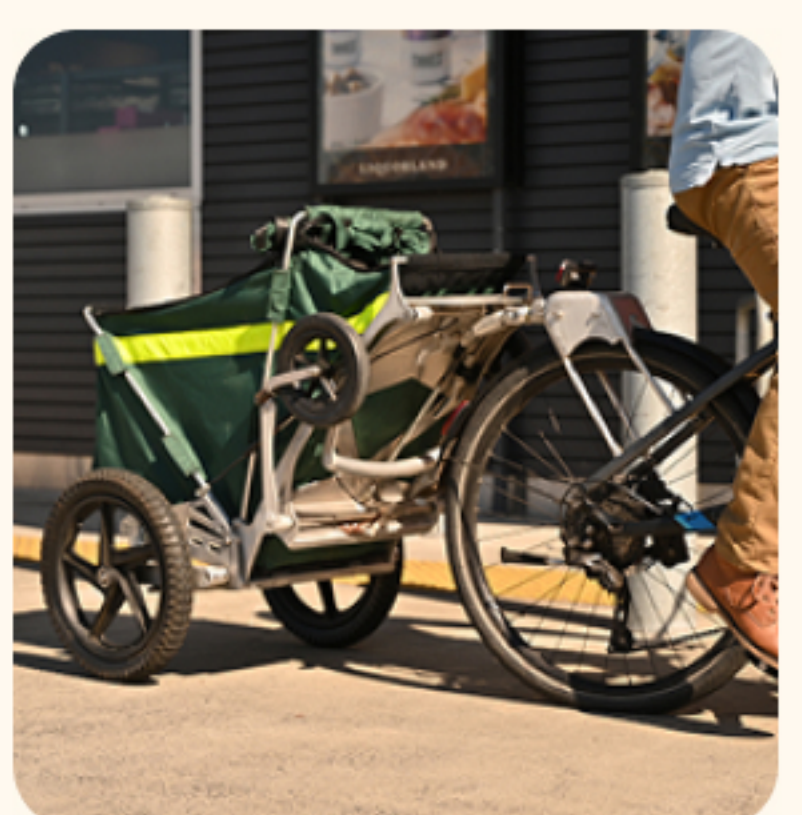
Errands & Parcels