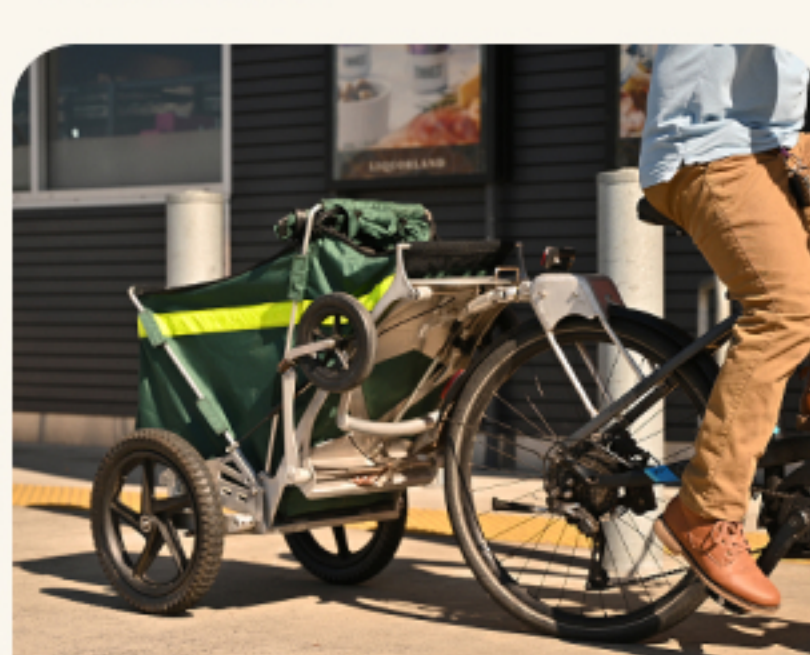
Errands & Deliveries